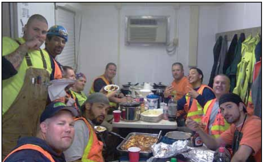
Dry shack potluck, Swedish Hospital job, Issaquah

When the rain is cold and the wind is blowing we look forward to our time in the dry shack. We look forward to sharing that 15 and 30 minutes when we're all on the same playing field, sharing food and a few good laughs. That's why we organized a potluck in our dry shack