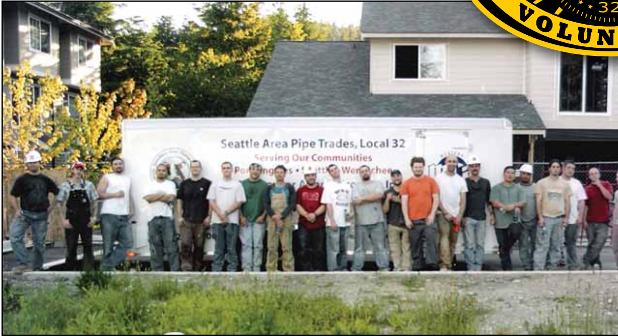
Residential Plumbing Apprentices at Paterson Park Habitat for Humanity, 2005